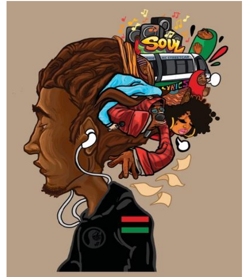
Original artwork by JT Daniels, 2018 Jtdanielsart.com

Through a competitive, open-call process, the KC Streetcar Authority will select local artists to create temporary, two-dimensional artwork to be displayed on 3-5 streetcar station stops. This artwork will be viewed by thousands of KC Streetcar riders and downtowners daily. Selected artists will receive an artist stipend of $500, plus project support to bring the artwork to the streetcar route for this outdoor program.